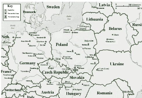
Map of Central and Eastern Europe – 'The same history, the same events do not necessarily mean the same thing to the people affected'

The Russian policy of dividing the EU and dealing bilaterally with member states or small groups of countries separately is not exceptional or outstandingly hostile. The EU is facing this problem not only in its relations towards Russia, but in fact towards all states, who consider themselves to be strong enough. So it is an EU problem and not something to blame the Russians for. This does not set the game in favour of the EU. At first sight, the Russian centralised and democratically unbound political system enjoys a big strategic advantage in this power play over the pluralistic EU, where every member has the ultimate say in many, often decisive, political fields. Maybe the world is not safer but more dangerous than at the time of the Cold War. Undoubtedly, however, it is more complicated and the de-centralised EU-system may turn out better prepared for future challenges in the long term.