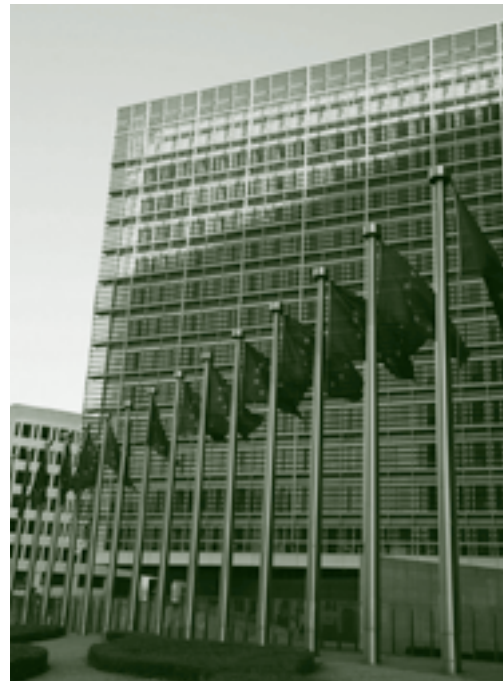
European Commission Berlaymont Building, Brussels

The veto with which the Polish leadership intended to draw the EU's attention to grievances in its relations with Russia, particularly a Russian ban on the import of Polish meat, had significant consequences. It was the first demonstration of the fact that new member states could and would efficiently block relations with an important third country. This came as a surprise not only to Russia, but also to some of the older and bigger member states. A similar development took place in the run-up to the EU-Russia Summit in Samara in May 2007, when the dispute between Russia and Estonia about the removal of a war monument from the city centre of Tallinn prompted the German EU presidency to sharply criticise the inappropriateness of the Russian reaction. This again undermined the start of the negotiations.