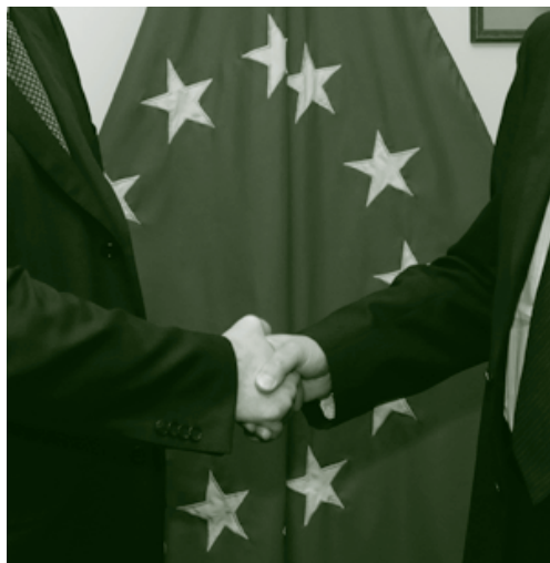
A common future for the EU and Russia?