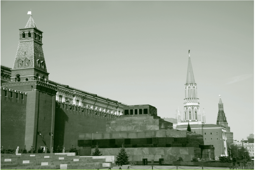
Kremlin and Lenin's tomb, Red Square, Moscow, Russia